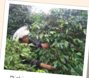
Picking coffee berries

Sought after by coffee connoisseurs, our Indonesian Sumatra Mandheling grade 1 Toba coffee comes from Northern Sumatra in the hills of the Lintong region which surrounds Lake Toba, formed millennia ago by a gigantic volcanic eruption. The result is excellent volcanic soil around the lake, which nurtures the quality of the trees grown by the native Batak tribe that use traditional washing and sun drying methods. The coffee is grown under scattered shade trees, without chemical fertilizers or pesticides. Coffee from Sumatra is full-bodied with slightly woody undertones and an herbal aroma.