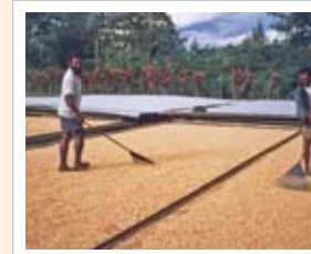
Raking beans as they dry in the sun

Stew Leonard's buys our Paupa New Guinea coffee from the Sigrí Coffee Estate, located in the highlands of Wahgi Valley at 5,200 feet above sea level. The plantation employs 6,000 people during peak harvesting season. The estate's strict quality control includes daily cup testing as well as hand sorting the beans for quality and grading. This mellow and full-bodied coffee stands apart in the cup – you can taste the influence of the rich volcanic soil that imparts a pungent, nutty flavor with a superb acidity.