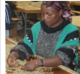
Sorting the green beans for size and removing defective beans

Ethiopia is the birthplace of coffee. Stew Leonard's buys Sidamo, a single origin coffee bean grown in the southern region of Ethiopia. The family we work with has been in the coffee business for generations and has their facilities high above sea level. Ethiopian Sidamo is prized for its acidity, with a citrus, lemony flavor and good balance.