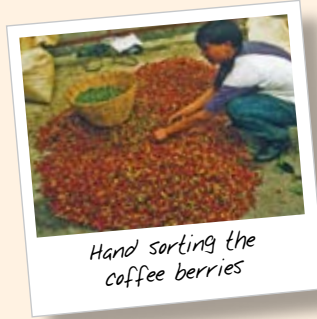
Hand sorting the coffee berries