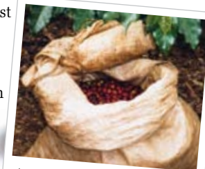
Just picked coffee berries

This coffee is sought after for its intense flavor, body and acidity from growing in high altitudes. The coffee is sold at auction, where we bid on only the highest quality beans (Kenya AA) from farmers who have been in the coffee business for generations.